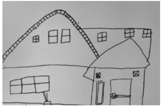
The West House at CTDS