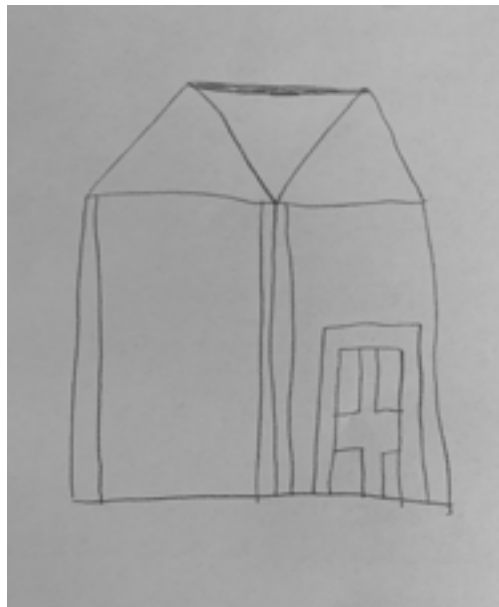
The Barn at CTDS